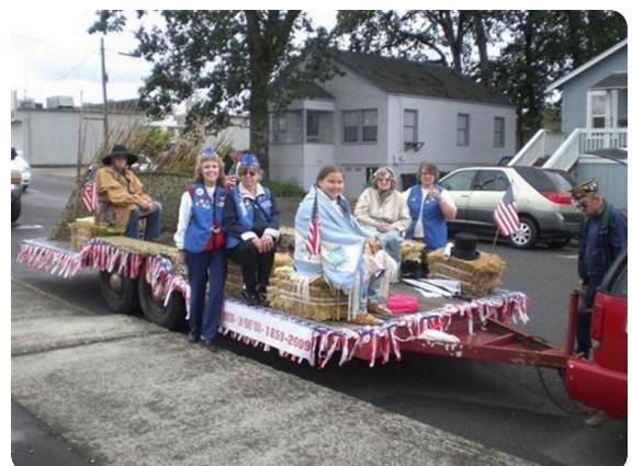
We won 2nd place for our efforts and because of the authentic way our participants presented